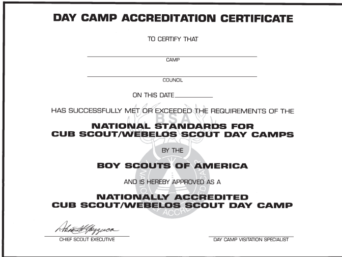
Day Camp Accreditation Certificate, No. 13-110