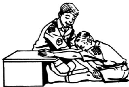
"Sit and reach" to measure lower-back flexibility.